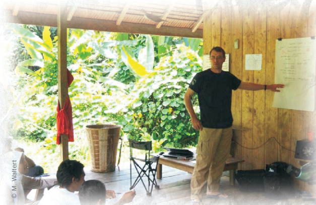
Workshops and seminars provide hands-on training in wildlife management and conservation.

Operating out of its neighbouring village base at Politcioman, SCP's community empowerment programme is aimed at improving welfare and child education as well as at encouraging new, sustainable approaches to local income generation.