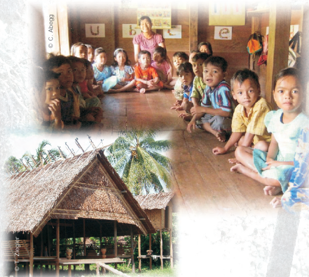
SCP's recently completed community education centre now provides the main focus for its village activities.

In order to achieve this objective, SCP is cooperating with numerous partner organisations at local, regional and national levels within Indonesia. Training in and transfer of technologies relevant to wildlife management and conservation are an important aspect of this work, as is the provision of scholarship opportunities for Mentawaian students.