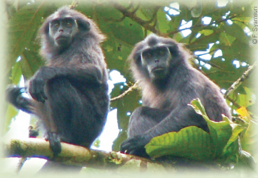
The Pig-tailed Langur ( Simias concolor ) is one of the world's 25 most endangered primate species.