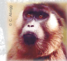
Siberut is home to its own species of macaque ( Macaca siberu ).